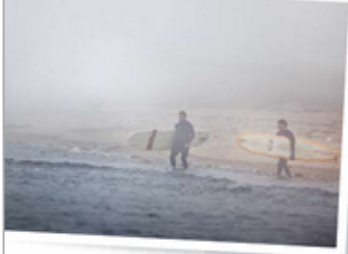
Top: A pair heads out to catch some waves.